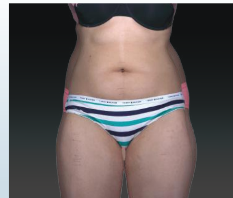
Overlay of before and after 8 treatments