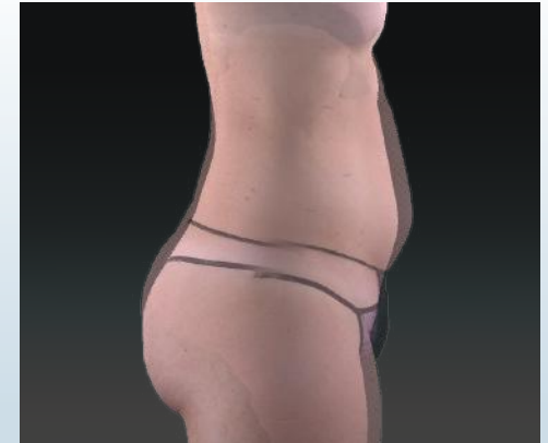
Overlay after 3rd treatment